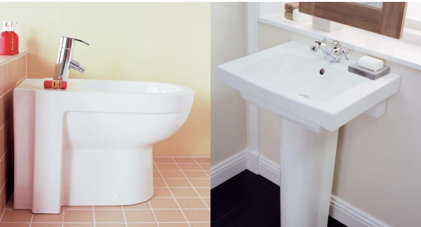
Naturally, the ARTic range also includes a bidet – unbeatable for intimate hygiene. Both wall and floor-mounted versions are available. The washbasin can be combined with a stand or cover. When mounted on brackets – as shown here – the edge of the washbasin completely conceals the brackets. LEFT 4100 ARTic bidet with Skandic 03 bidet mixer with Leg lever. RIGHT 4550 Washbasin, 4920 stand and Madison washbasin mixer from Dornbracht.