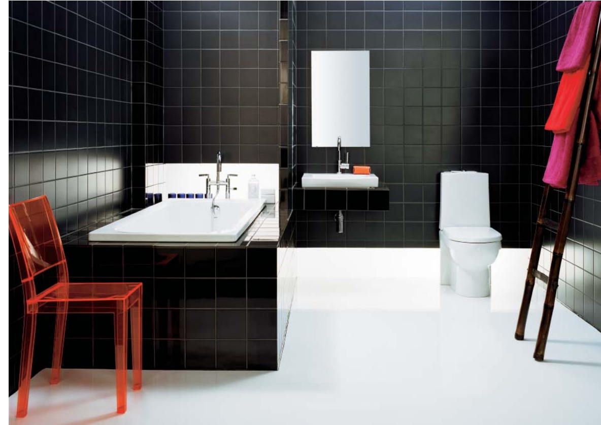
THE COVER features the 4300 WC and 4551 washbasin from our new ARTic bathroom range – two of our new everyday heroes shown here for the first time. The WC features dual flush and a built-in S-trap. It is also available with a built-in P-trap and as a wall-mounted model for fitting with a built-in cistern. The floor-mounted WCs can be fitted tight to the wall, and the back of the WC stand allows space for the necessary pipework. The ARTic washbasins are available in a range of shapes and sizes. Most of the wall-mounted models are designed for both bracket and bolt-fitting. When mounted on brackets, the washbasin edges fit very snugly – neat! PICTURE ABOVE Tiled-in ARTic bathtub with overflow drain and Tara Classic bathtub mixer. Recessed 4551 ARTic washbasin with water trap and Tara Classic mixer from Dornbracht. 4300 ARTic WC with dual flush and built-in S-trap. Tiles from Villeroy & Boch: D 344 and D 114 Grani colour/Maxi wall.